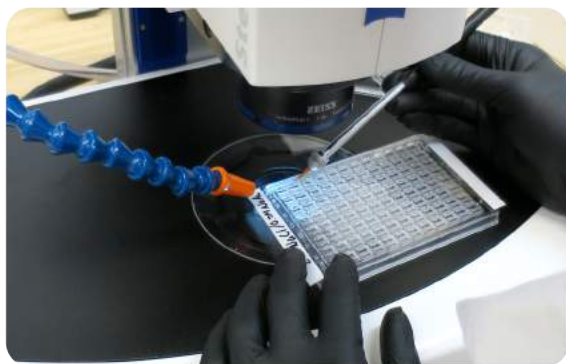
(Directed Nozzle Workstation in use)

The Humidified Chamber Workstation accepts drops on 18 or 22 mm cover slips or on standard microscope slides. Crystals can be harvested and manipulated within the workstation using standard crystal loops and magnetic wands. The workstation is designed to work on standard stereo microscopes with working distances of 60 mm or larger.