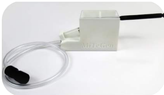
(Humidified Chamber Workstation)