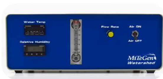
(Watershed Control Unit)

Precisely control the output humidity to either the humidified chamber or direct nozzle workstations. Simple controllers allow users to quickly adjust parameters to change the humidity and flow rate of the output stream.