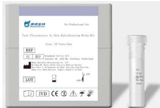
Fast FISH Probe Kit