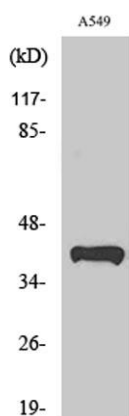
Western Blot analysis of various cells using Peroxin 14 Polyclonal Antibody

The protein is integrated into peroxisome membranes with its C-terminus exposed to the cytosol, and interacts with the cytosolic receptor for proteins containing a PTS1 peroxisomal targeting signal. The protein also functions as a transcriptional corepressor and interacts with a histone deacetylase. A mutation in this gene results in one form of Zellweger syndrome. [provided by RefSeq, Jul 2008],