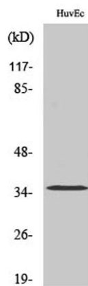
Western Blot analysis of various cells using Olfactory receptor 7C2 Polyclonal Antibody

perception of a smell. The olfactory receptor proteins are members of a large family of G-protein-coupled receptors (GPCR) arising from single coding-exon genes. Olfactory receptors share a 7-transmembrane domain structure with many neurotransmitter and hormone receptors and are responsible for the recognition and G protein-mediated transduction of odorant signals. The olfactory receptor gene family is the largest in the genome. The nomenclature assigned to the olfactory receptor genes and proteins for this organism is independent of other organisms. [provided by RefSeq, Jul 2008],