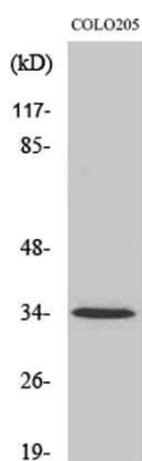
Western Blot analysis of various cells using Olfactory receptor 5P3 Polyclonal Antibody

proteins are members of a large family of G-protein-coupled receptors (GPCR) arising from single coding-exon genes. Olfactory receptors share a 7-transmembrane domain structure with many neurotransmitter and hormone receptors and are responsible for the recognition and G protein-mediated transduction of odorant signals. The olfactory receptor gene family is the largest in the genome. The nomenclature assigned to the olfactory receptor genes and proteins for this organism is independent of other organisms. [provided by RefSeq, Jul 2008],