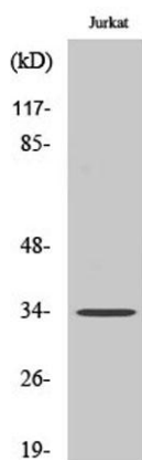
Western Blot analysis of various cells using Olfactory receptor 51D1 Polyclonal Antibody

G-protein-coupled receptors (GPCR) arising from single coding-exon genes. Olfactory receptors share a 7-transmembrane domain structure with many neurotransmitter and hormone receptors and are responsible for the recognition and G protein-mediated transduction of odorant signals. The olfactory receptor gene family is the largest in the genome. The nomenclature assigned to the olfactory receptor genes and proteins for this organism is independent of other organisms. [provided by RefSeq, Jul 2008],