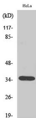
Western Blot analysis of various cells using Olfactory receptor 10H1 Polyclonal Antibody

G-protein-coupled receptors (GPCR) arising from single coding-exon genes. Olfactory receptors share a 7-transmembrane domain structure with many neurotransmitter and hormone receptors and are responsible for the recognition and G protein-mediated transduction of odorant signals. The olfactory receptor gene family is the largest in the genome. The nomenclature assigned to the olfactory receptor genes and proteins for this organism is independent of other organisms. [provided by RefSeq, Jul 2008],