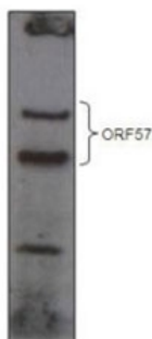
HHV8 ORF57 antibody western blot analysis of over-expressed GFP-tagged ORF57 in HEK293T cell line.